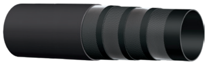
T740AA Series with CHC Couplings Wire Reinforced Concrete Pumping Hose