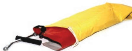
Polyamide pack for storage & transport